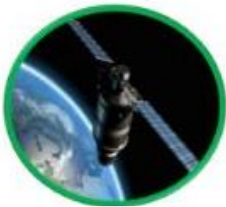
Aerospace & Defence